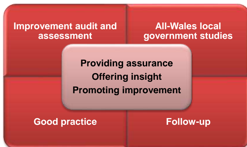
Exhibit 4: Components of my performance audit work